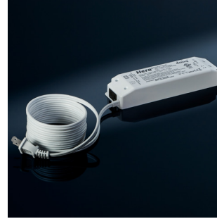
Daisy Driver, 96W (Full Specs on Page #96)