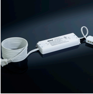
Daisy Driver, 30W (Full Specs on Page #94)