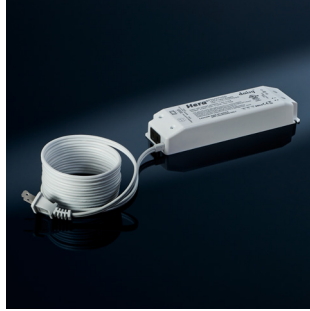
Daisy Driver, 75W (Full Specs on Page #95)