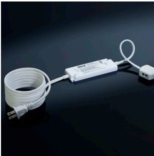
Driver, 6W (Full Specs on Page #98)